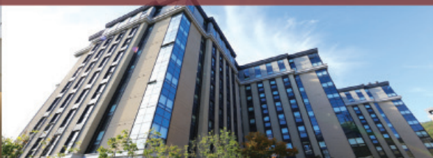
ON - CAMPUS Dormitory